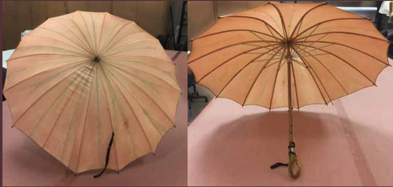
Original 1920's Parasol frame with a Bakelite handle and rib tips.